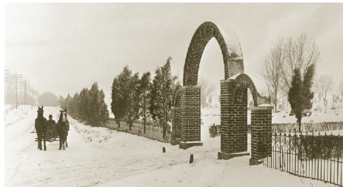
Fair View manager coming to work on a horse-drawn carriage. Salem Turnpike Entrance – Circa 1920