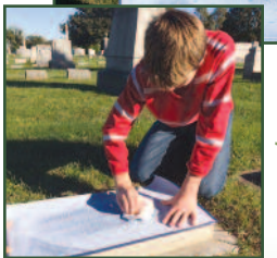
This young man has always been fascinated with the details of cemetery duties