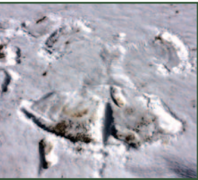
A child saw snow for the first time at his grandmother’s funeral, so he wanted to make a snow angel—how appropriate