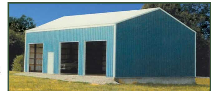
Photos above, top: the old shed as featured in the 2007 newsletter (torn down shortly after the photo was taken). Bottom photo: the proposed image of the new work shed. The crew is eager for a new work space!

ARBOR DAY IN OBSERVANCE OF ARBOR DAY ON APRIL 27 TH , FAIR VIEW PLANTED A ROW OF TREES