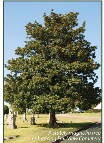
A stately magnolia tree enhancing Fair View Cemetery