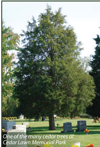
One of the many cedar trees at Cedar Lawn Memorial Park