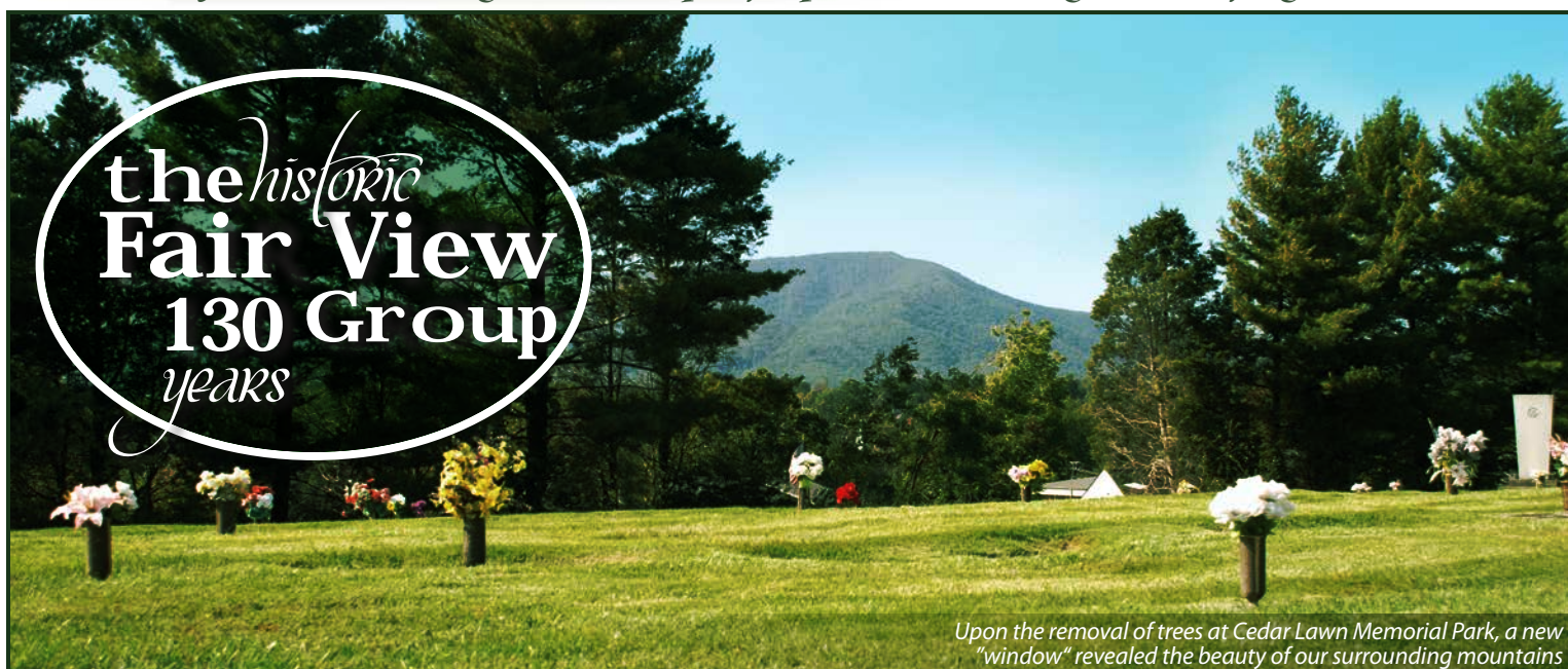
Upon the removal of trees at Cedar Lawn Memorial Park, a new "window" revealed the beauty of our surrounding mountains

Peaceful Retreat - Going Green - Property Updates - Tree Program - Staying Connected